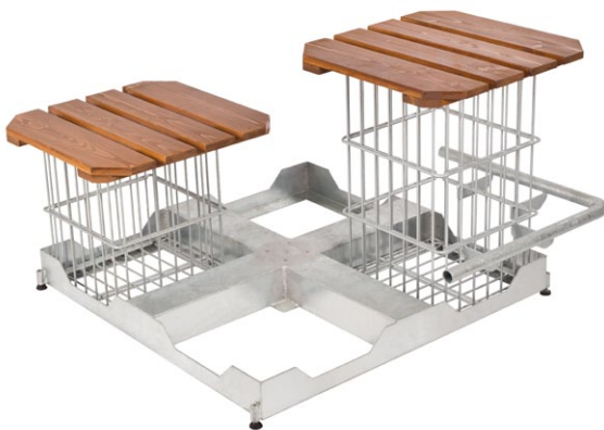
Sheet stand Dublin 8Z with Multicube 40 (left) and Multicube 60 with welded-on foot rail (right).